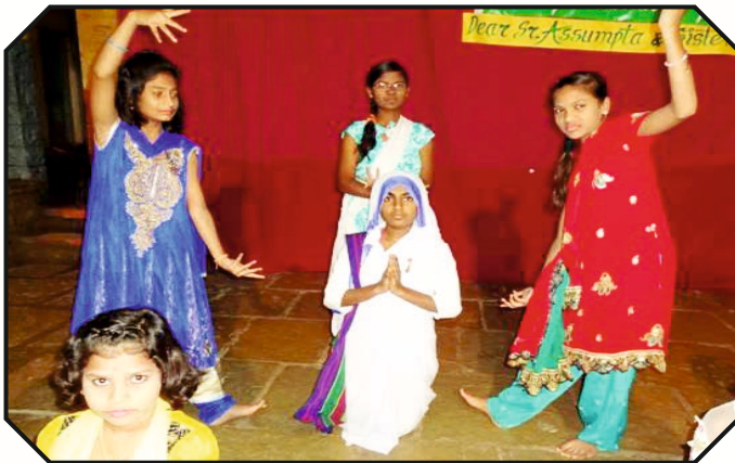
Jyothi Nilaya Hostel, Chitthapur