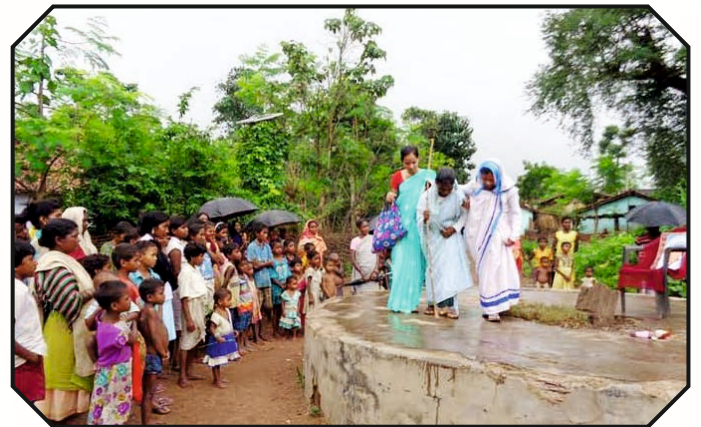
St Theresa's Tribal Girls' Home, Maluka