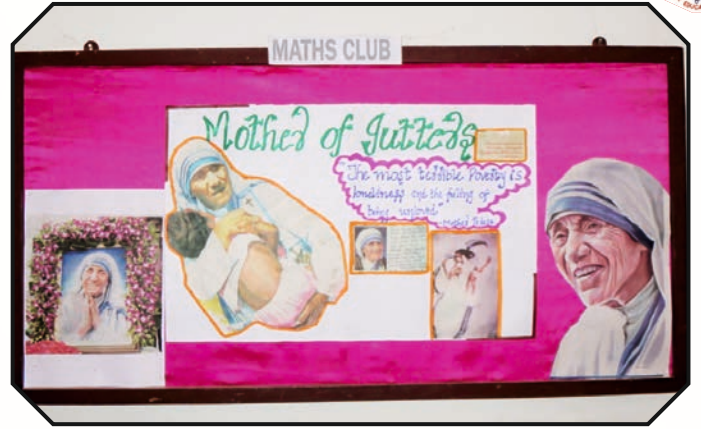
Msgr Raymond Memorial School, Chempanoda