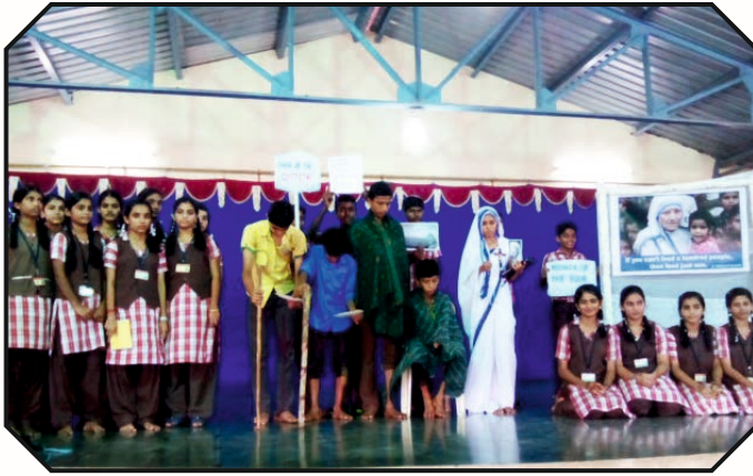
Bethany Eng Med High School, Puttur