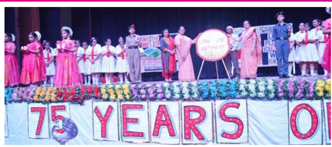
Sacred Heart Convent School, Ludhiana