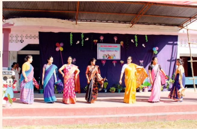
Holy Cross Convent School, Dharmanagar