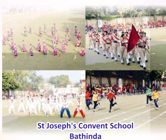
St Joseph's Convent School Bathinda