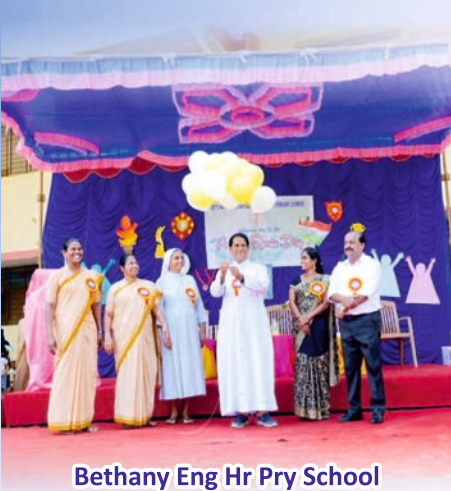
Bethany Eng Hr Pry School Mulki