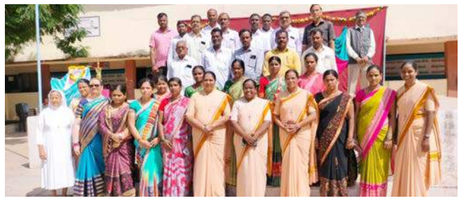
Bethany Institutions, Chittapur