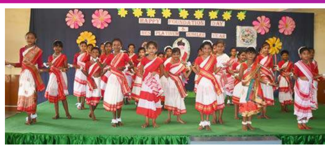
Bethany Convent School, Ushamatu