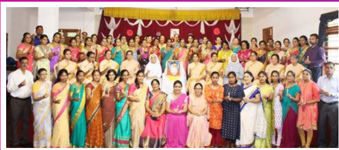
Sacred Hearts' Institutions, Kulshekar