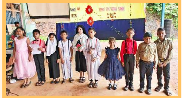
St Sebastian's High School, Loliem, Goa