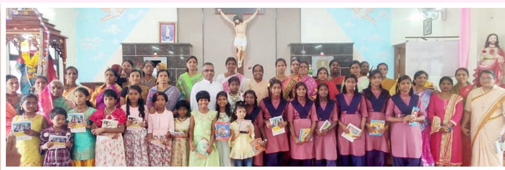
Bethany High School, Chittapur