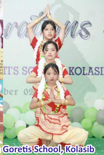
Maria Goretis School, Kolasib