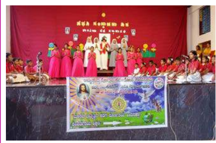
Ave Maria Hr Pry School, Sirsi