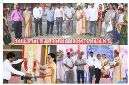
St Michael's, Dandeli