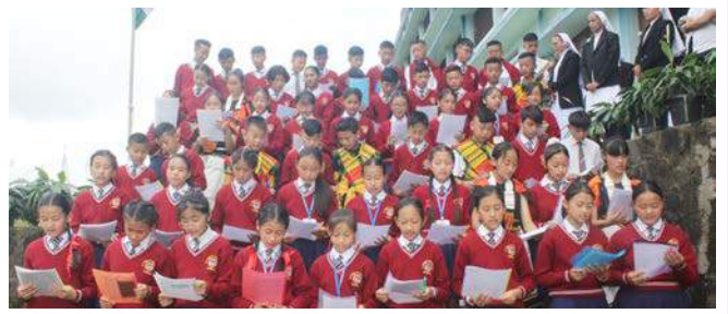
St Joseph Hr Sec. School, Viswema