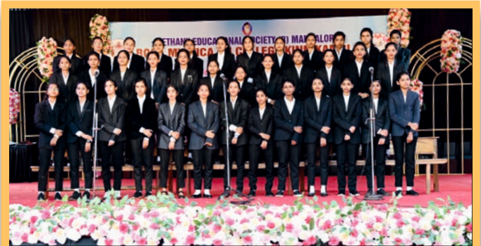
Rosa Mystica PUC, Kinnikambla