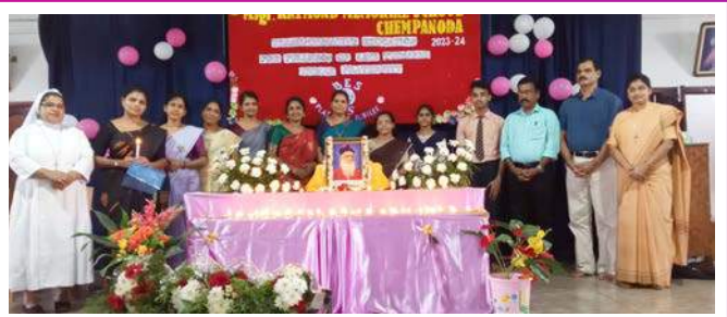
Mgr Raymond Memorial School, Chempanoda