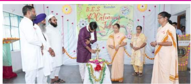
Sacred Heart Convent School, Ramdas