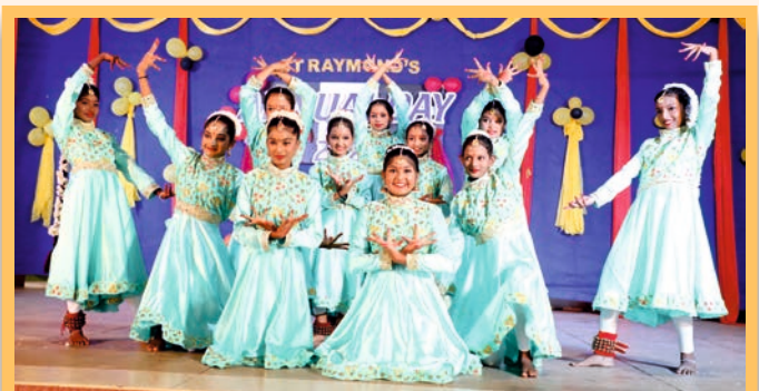
St Raymond Eng Med School, Vamanjoor