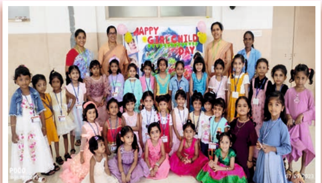
St Raymond Pre Primary School, Vamanjoor