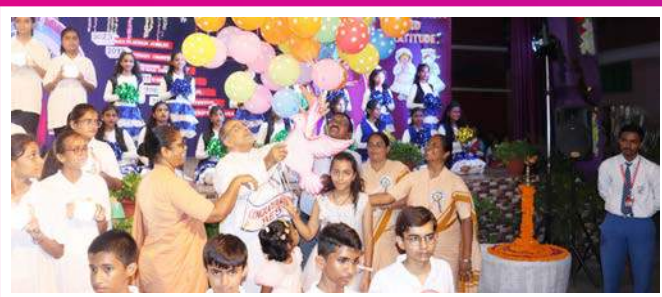
Bethany Convent School, Naini