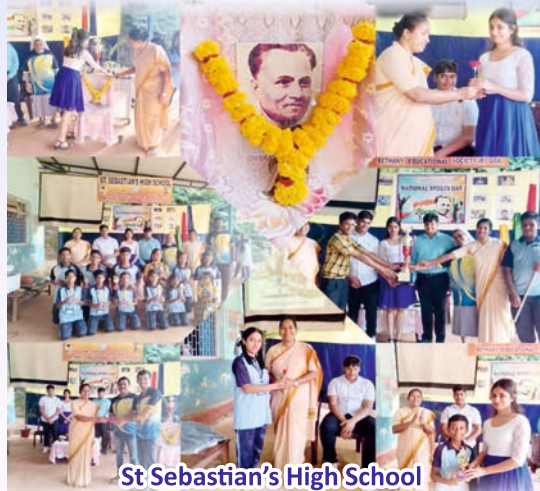
St Sebastian's High School Loliem, Goa