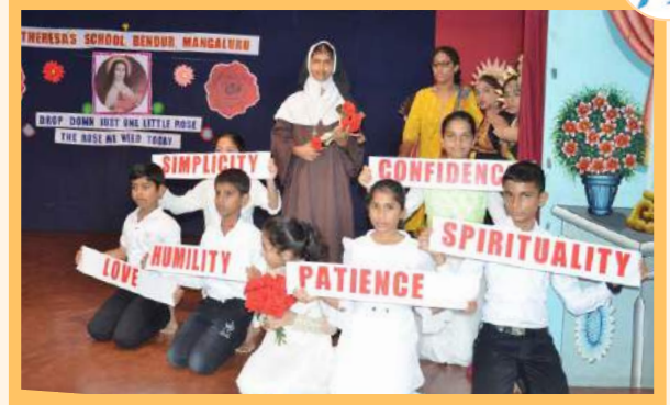
St Theresa School, Bendur