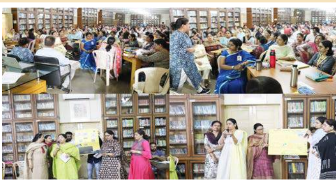
Sustainable Development Goals