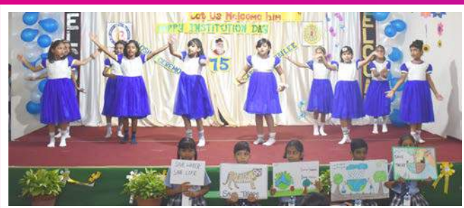
Bethany Convent School, Greater Noida