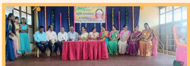
St Joseph's Kan. Hr Pry School, Sagar