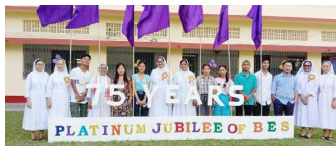
Bethany Convent School, Gorchuk