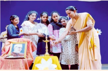
Bethany Eng Med. Pry School, Mulki