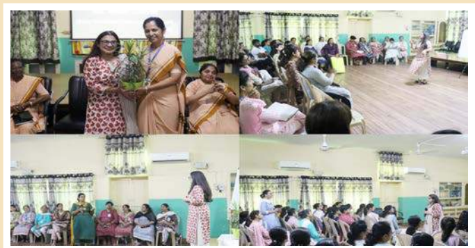
Teachers' Capacity Building Programme