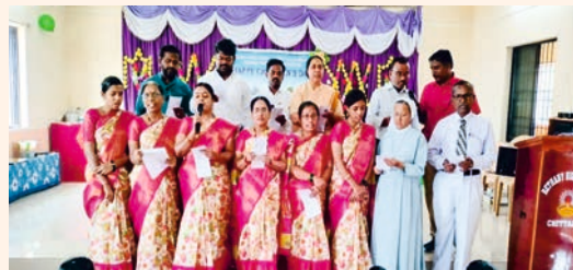
Bethany High School, Chittapur