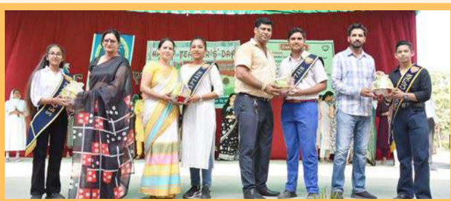
Sacred Heart Convent School Barnala