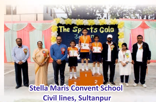
Stella Maris Convent School Civil lines, Sultanpur