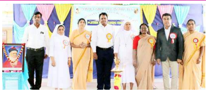
Loyola Campus, Gadag