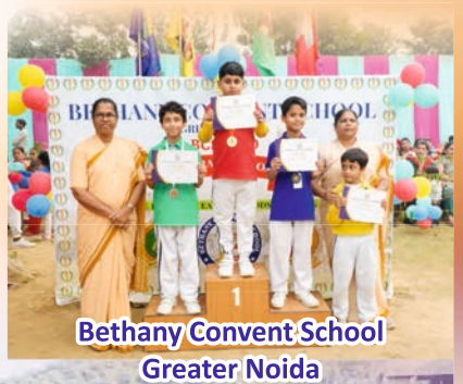
Bethany Convent School Greater Noida