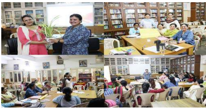
English Capacity Building