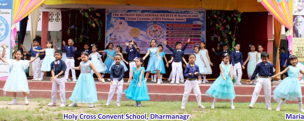
Holy Cross Convent School, Dharmanagr