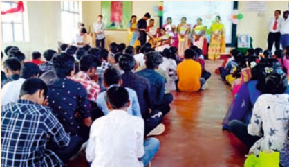
Jyothi Eng. Med. High School Kacharakannahalli