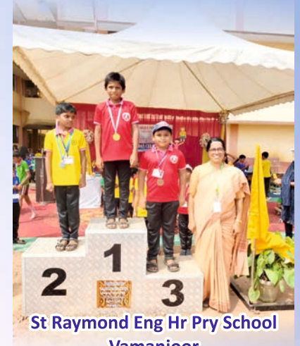
St Raymond Eng Hr Pry School Vamanjoor