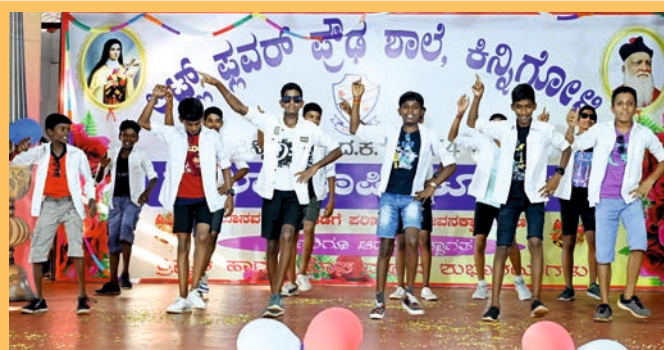
Little Flower High School Kinnigoli