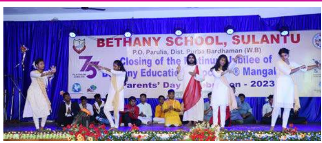
Bethany School, Sulantu