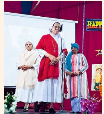
Gulabi Hr Pry School Jayamahall