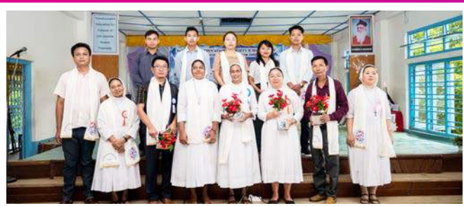
St Francis of Assisi High School, Mamit