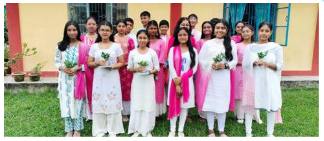
Bethany School, Khayerpur