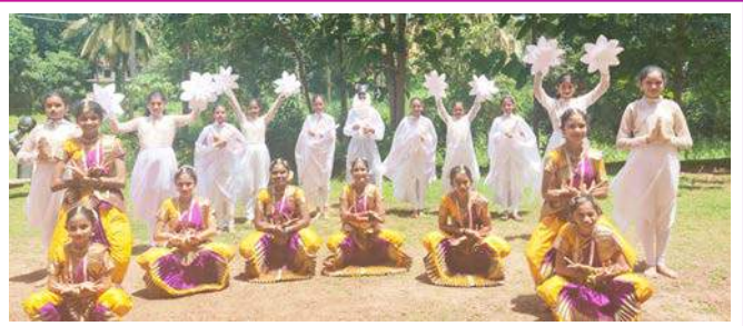
Madeleine & Bethany Institutions, Mulki