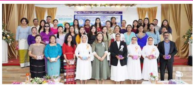
Mary Mount School, Aizawl