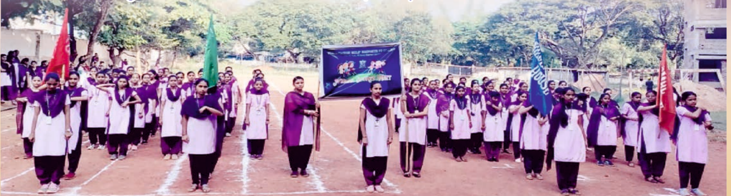
Presentation PUC, Dharwad