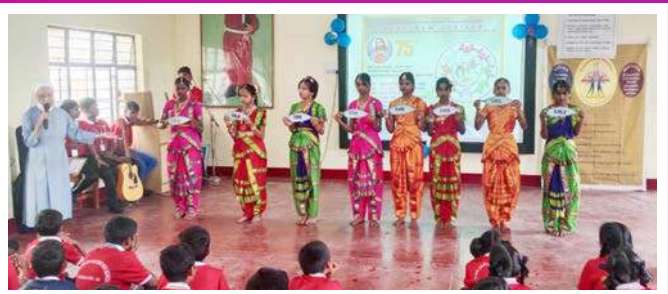
Jyothi Campus, Kacharakanahalli