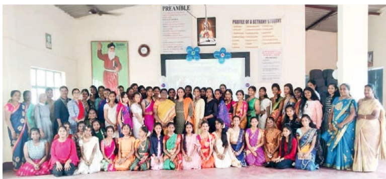
Jyothi English Medium High School, Kacharakanahalli