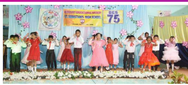
St Sebastian's High School, Loliem