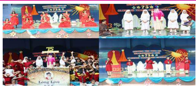
St Joseph's Convent School, Bathinda