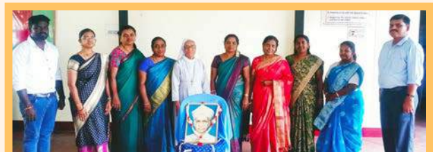
Jyothi Eng. High School, Kacharakanahalli