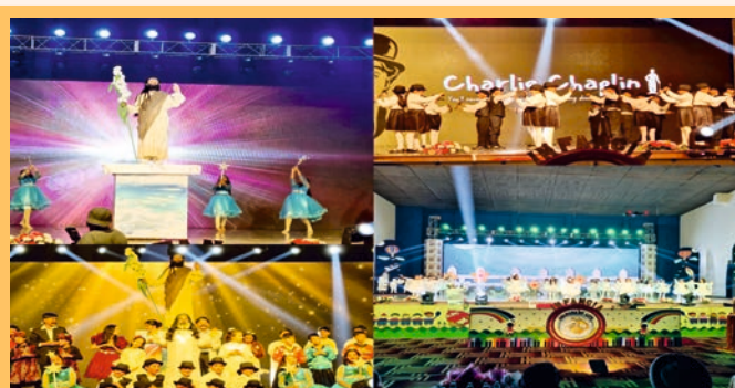
St Joseph's Convent School, Bathinda