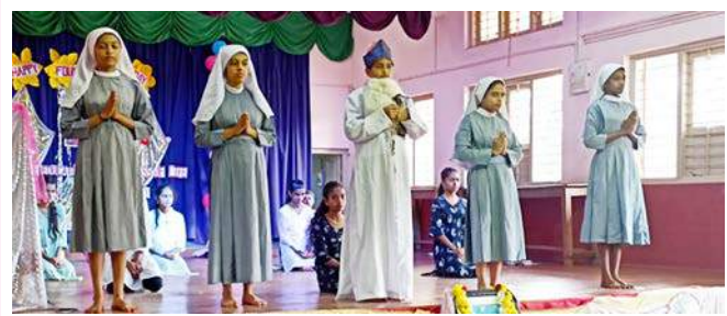
Ave Maria High School, Sirsi