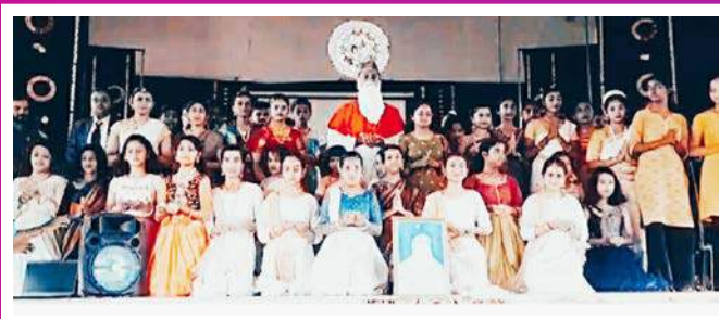
St Joseph's Mankalale