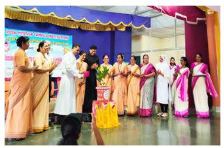
Rosa Mystica and Bethany Education Institutions, Kinnikambla