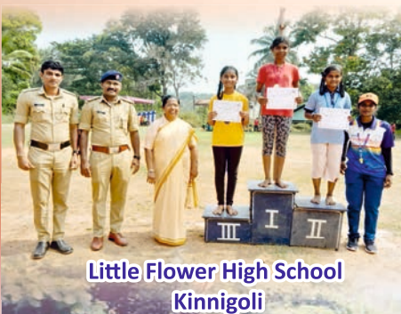
Little Flower High School Kinnigoli