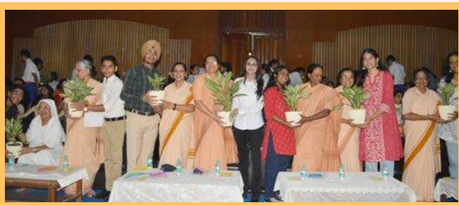
Sacred Heart Convent School, Ludhiana