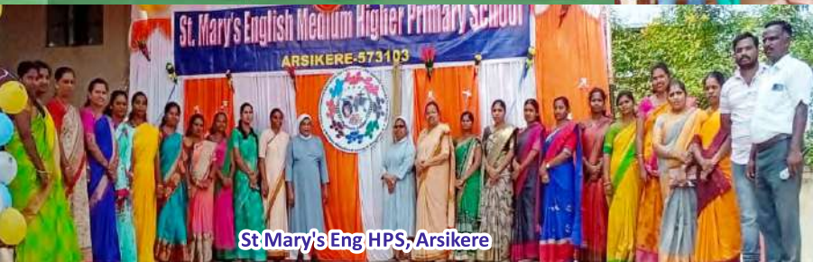
St Mary's Eng HPS, Arsikere