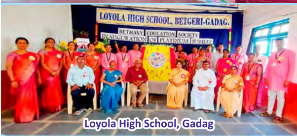
Loyola High School, Gadag