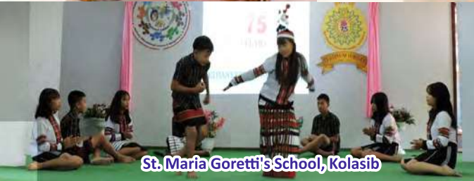
St. Maria Goretti's School, Kolasib