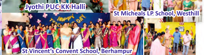
St Vincent's Convent School, Berhampur