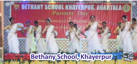
Bethany School, Khayerpur