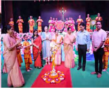
Sacred Heart Convent International School, Ludhiana