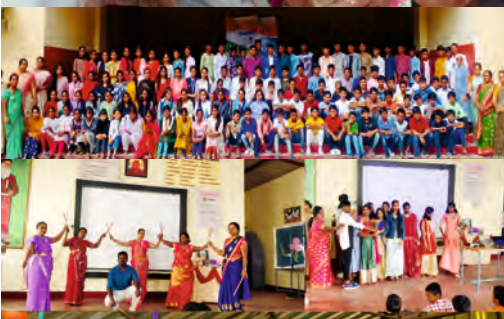
Jyothi Eng High School, KKHalli