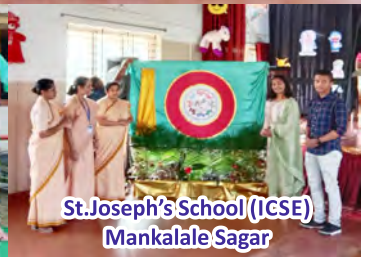
St. Joseph's School (ICSE) Mankalale Sagar