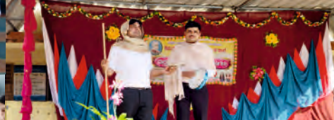
St Joseph Eng HPS, Sagar