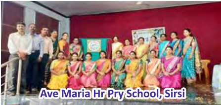
Ave Maria Hr Pry School, Sirsi