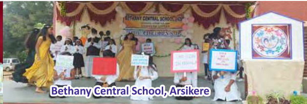
Bethany Central School, Arsikere