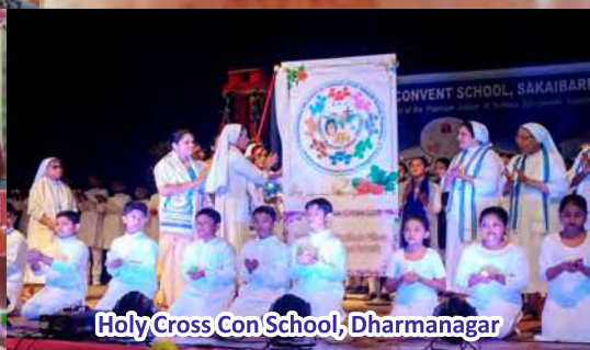
Holy Cross Con School, Dharmanagar