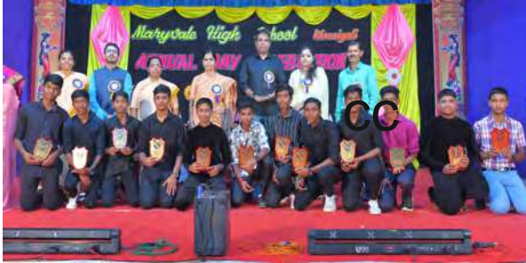
Maryvale High School, Kinnigoli