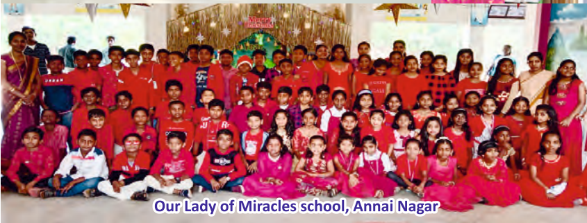
Our Lady of Miracles school, Annai Nagar