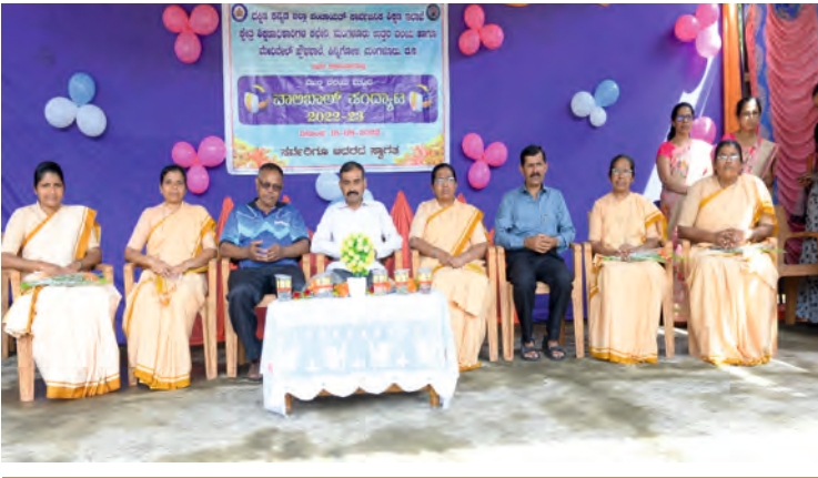
Maryvale High School, Kinnigoli