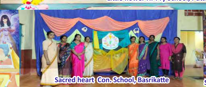
Sacred heart Con. School, Basrikatte