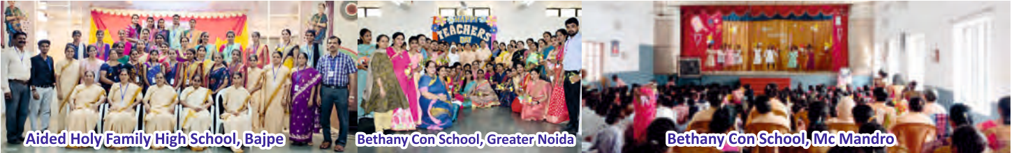
Aided Holy Family High School, Bajpe