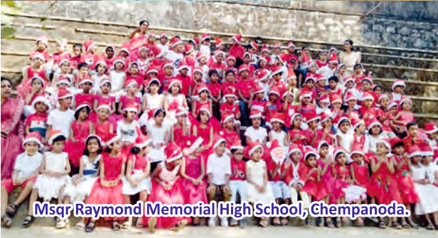
Msq Raymond Memorial High School, Chempanoda.