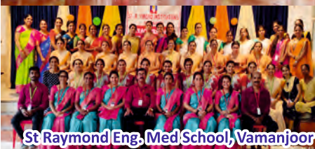
St Raymond Eng. Med School, Vamanjoor