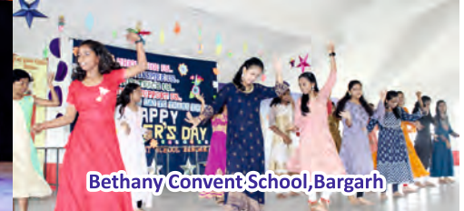
Bethany Convent School, Bargarh