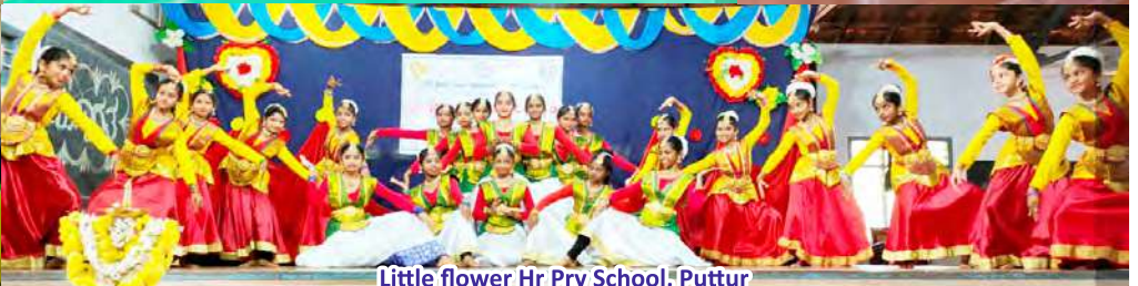
Little flower Hr Pry School, Puttur