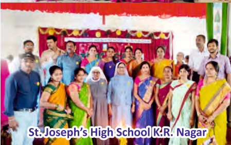
St. Joseph's High School K.R. Nagar