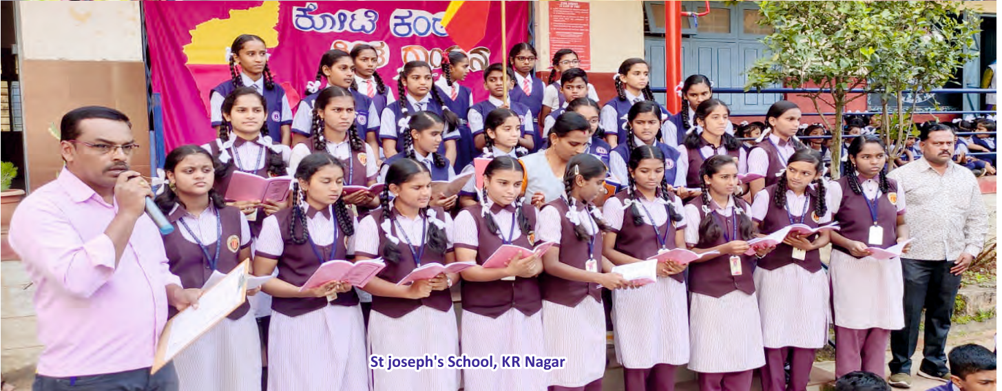
St. Joseph's School, KR Nagar