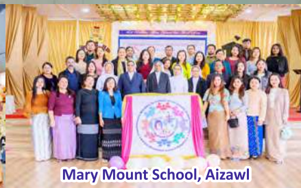
Mary Mount School, Aizawl