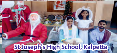
St Joseph's High School, Kalpetta