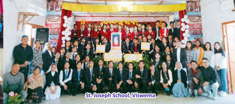
St. Joseph School, Viswema