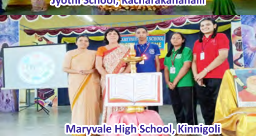
Maryvale High School, Kinnigoli