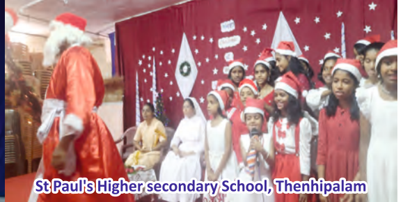
St Paul's Higher secondary School, Thenhipalam