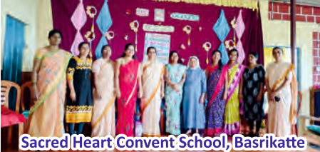
Sacred Heart Convent School, Basrikatte