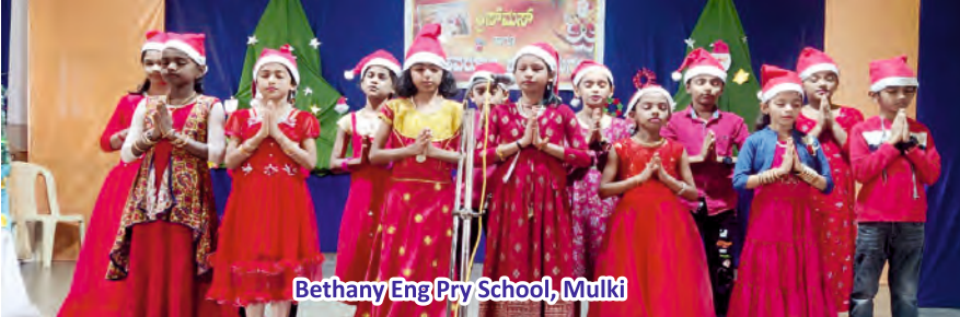
Bethany Eng Pry School, Mulki