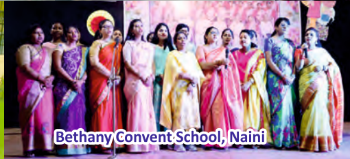
Bethany Convent School, Naini