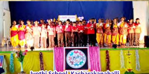
Jyothi School, Kacharakanahalli