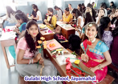
Gulabi High School, Jayamahala