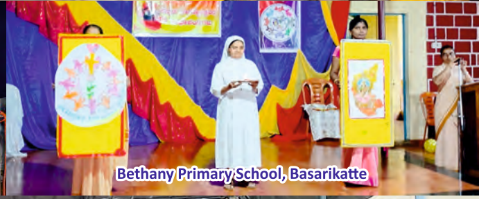
Bethany Primary School, Basarikatte