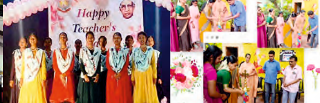
St. Michael's Convent High School, Ambewadi