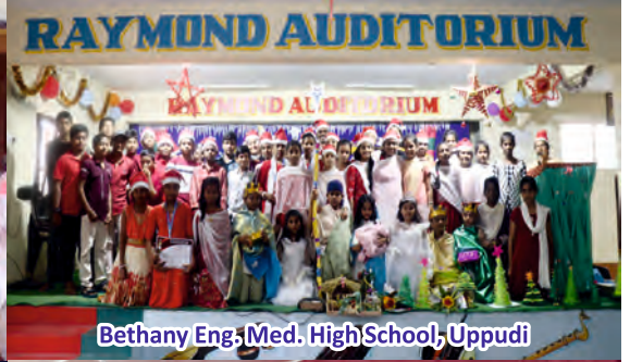
Bethany Eng. Med. High School, Uppudi