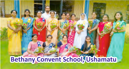
Bethany Convent School, Ushamatu