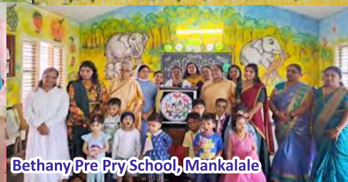
Bethany Pre Pry School, Mankalale