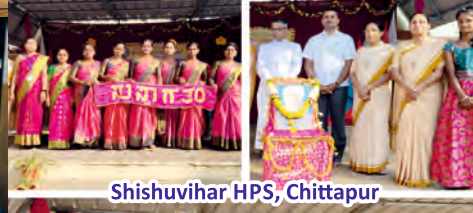
Shishuvihar HPS, Chittapur