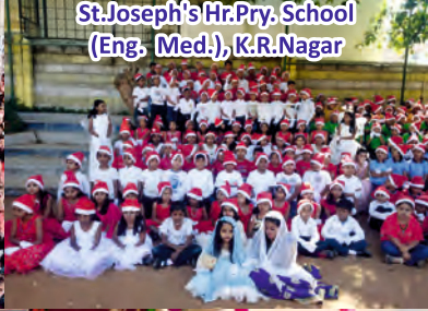
St. Joseph's Hr. Pry. School (Eng. Med.), K.R.Nagar