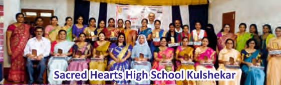
Sacred Hearts High School Kulshekar