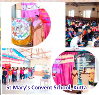
St Mary's Convent School, Kutta