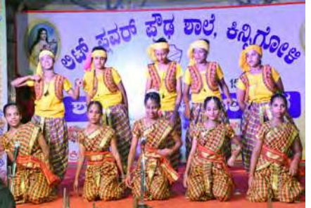
Little Flower High School, Kinnigoli