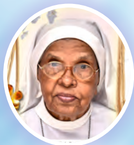
Sr Benjamine BS