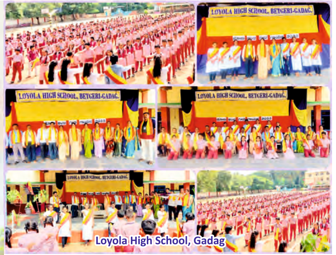
Loyola High School, Gadag