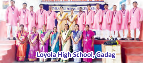
Loyola High School, Gadag