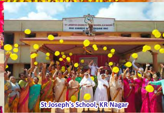
St Joseph's School, KR Nagar