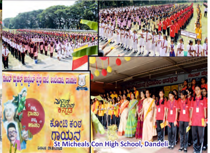
St. Michaels Con High School, Dandeli