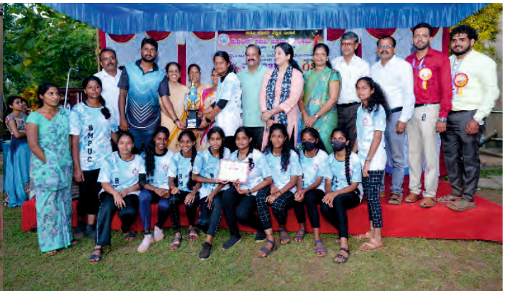
Madeleine PU College, Mulki