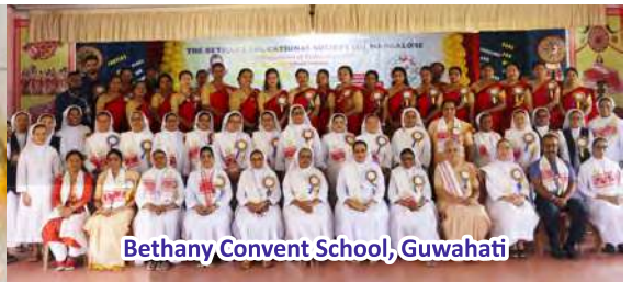
Bethany Convent School, Guwahati