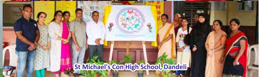
St Michael's Con High School, Dandeli