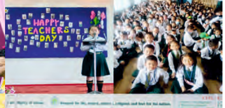
Mary Mount School, Aizawl