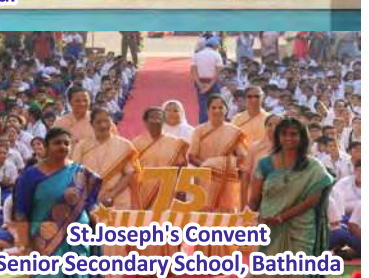
St. Joseph's Convent Senior Secondary School, Bathinda