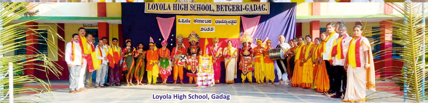
Loyola High School, Gadag