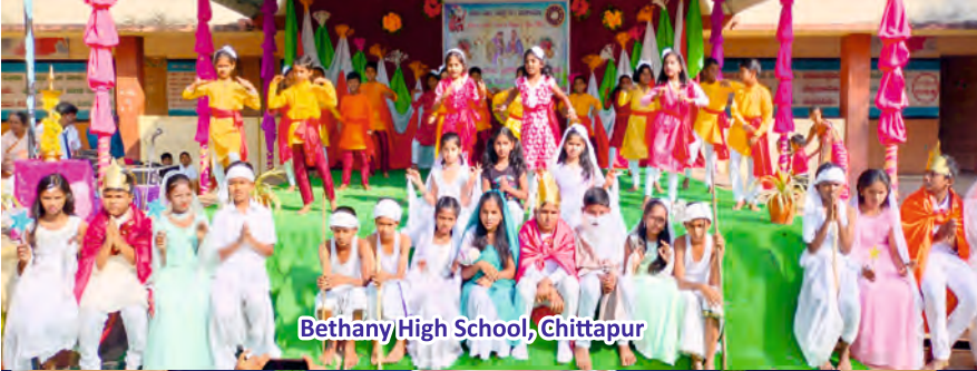
Bethany High School, Chittapur