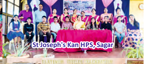
St Joseph's Kan HPS, Sagar