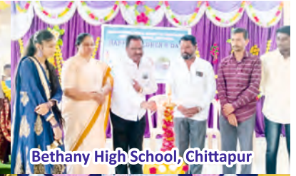
Bethany High School, Chittapur