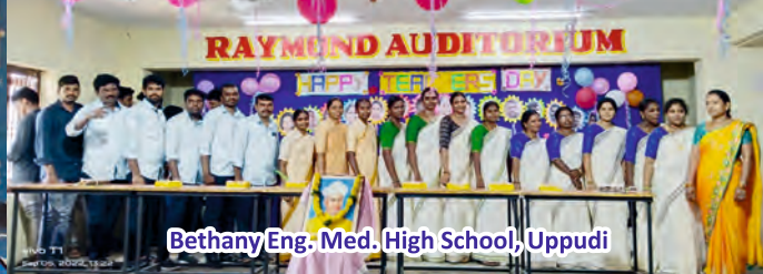
Bethany Eng. Med. High School, Uppudi