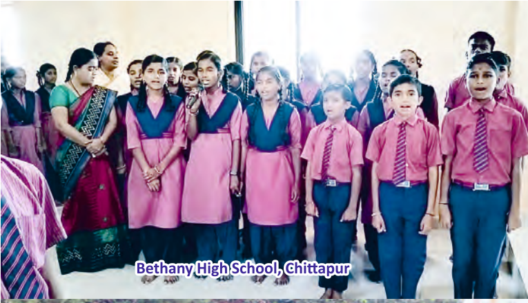
Bethany High School, Chittapur