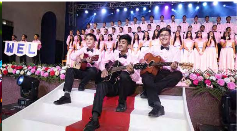
St Joseph's Convent Sen. Sec. School, Bathinda