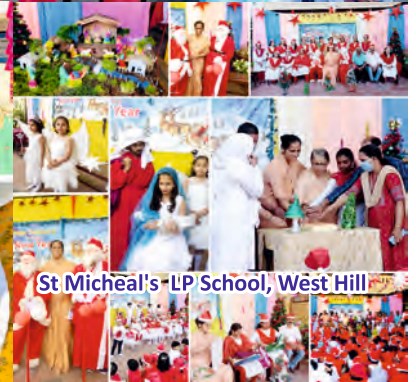
St Micheal's - LP School, West Hill