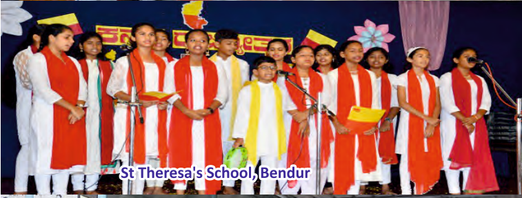
St Theresa's School, Bendur