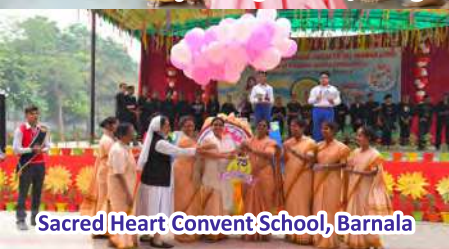
Sacred Heart Convent School, Barnala