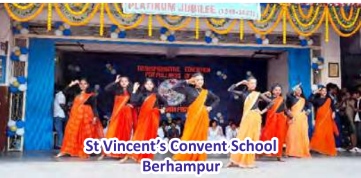
St Vincent's Convent School Berhampur