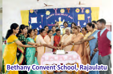
Bethany Convent School, Rajaulatu