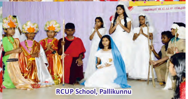
RCUP School, Pallikunnu