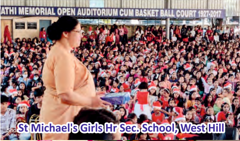
St Michael's Girls Hr Sec. School, West Hill