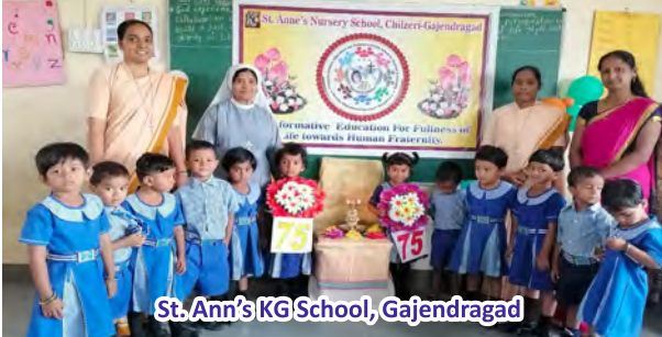
St. Ann's KG School, Gajendragad