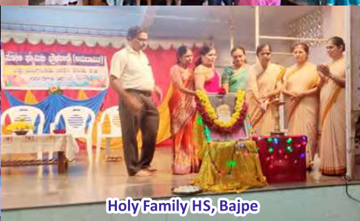
Holy Family HS, Bajpe