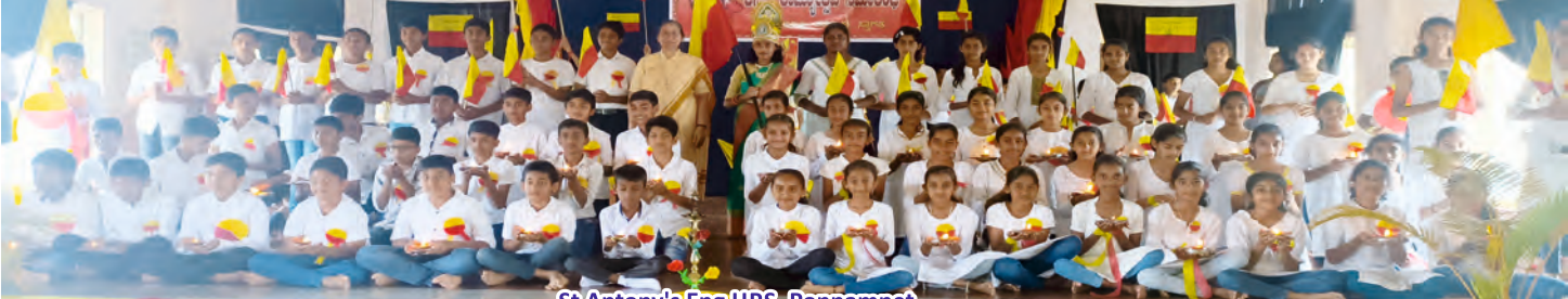
St Antony's Eng HPS, Ponnampet