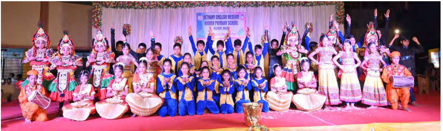
Bethany Eng Med.Pry School Kilpady, Mulki