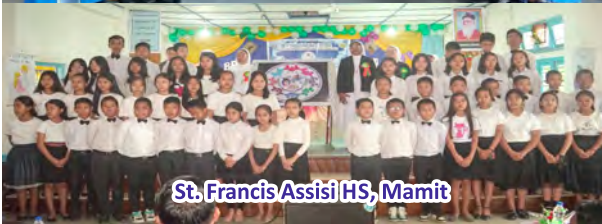
St. Francis Assisi HS, Mamit