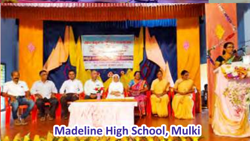
Madeline High School, Mulki