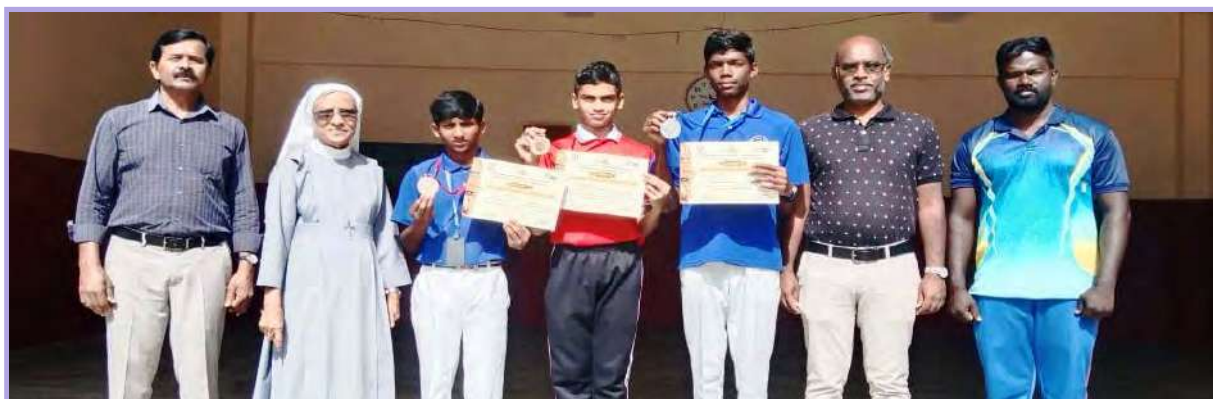
Jyothi High School, Kacharakanahalli