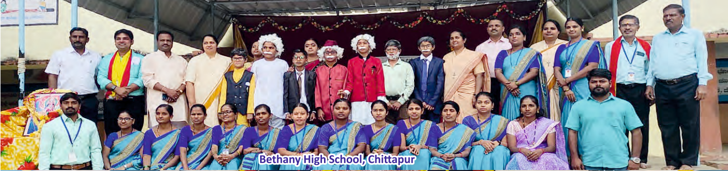
Bethany High School, Chittapur