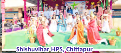
Shishuvihar HPS, Chittapur