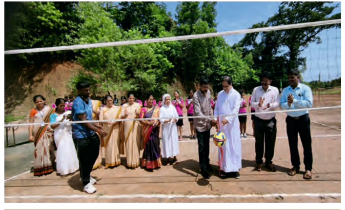
Bethany English Medium School, Mulki