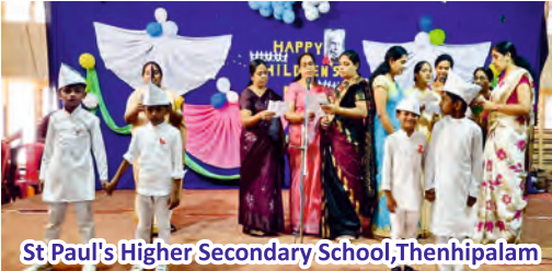
St Paul's Higher Secondary School, Thenhipalam