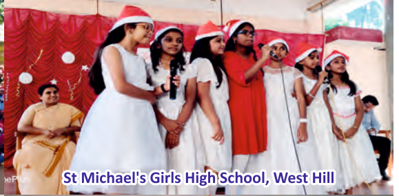
St Michael's Girls High School, West Hill