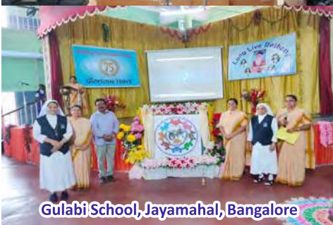
Gulabi School, Jaymahal, Bangalore