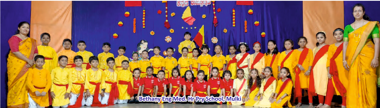
Bethany Eng Med. Hr Prry School, Mulki