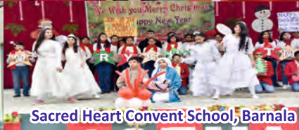
Sacred Heart Convent School, Barnala