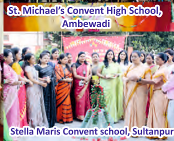
Stella Maris Convent school, Sultanpur