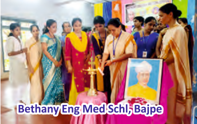
Bethany Eng Med Schl, Bajpe