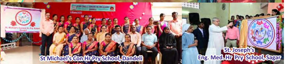
St Michael's Con Hr Pry School, Dandeli