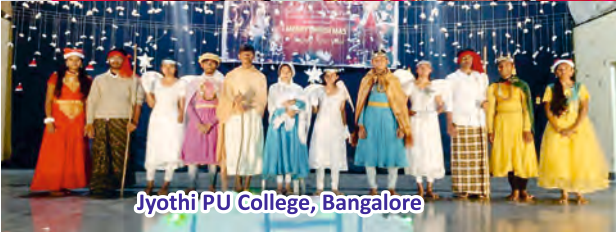
Jyothi PU College, Bangalore