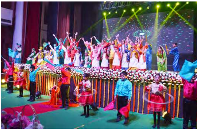
Sacred Heart Convent Sen Sec School, Ludhiana