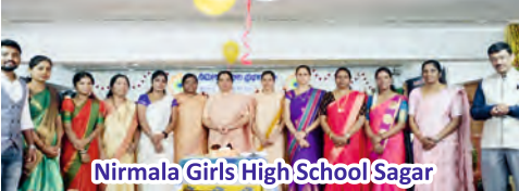
Nirmala Girls High School Sagar