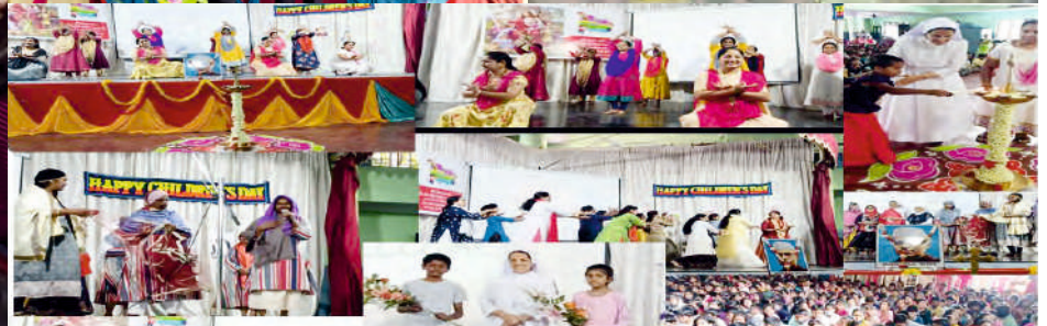
Gulabi HPS, Jayamahala