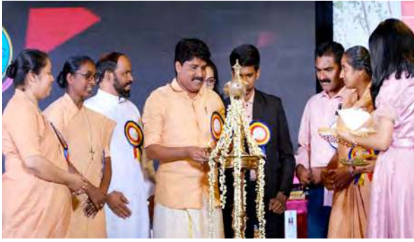
St Joseph Convent School, Kalpetta