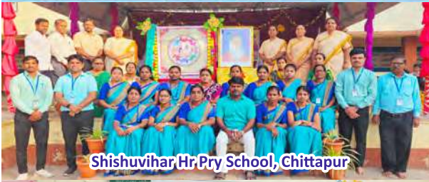
Shishuvihar Hr, Pry School, Chittapur