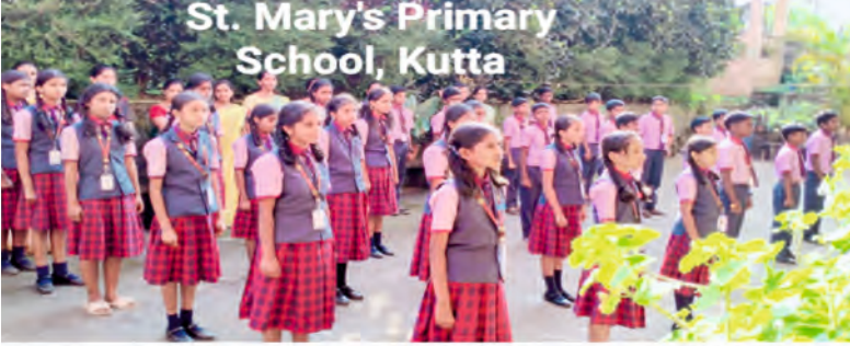
St. Mary's Primary School, Kutta