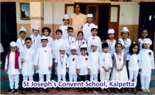
St Joseph's Convent School, Kalpetta