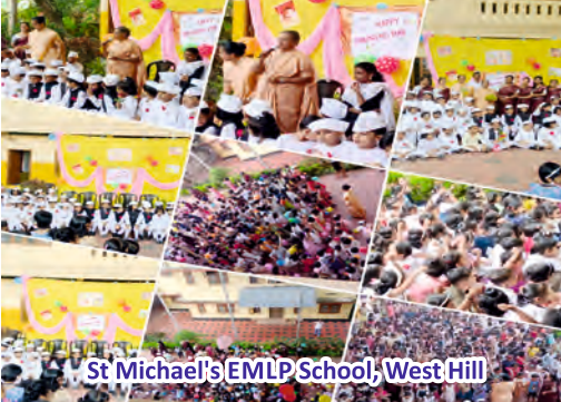
St Michael's EMLP School, West Hill