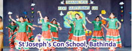
St Joseph's Con School, Bathinda