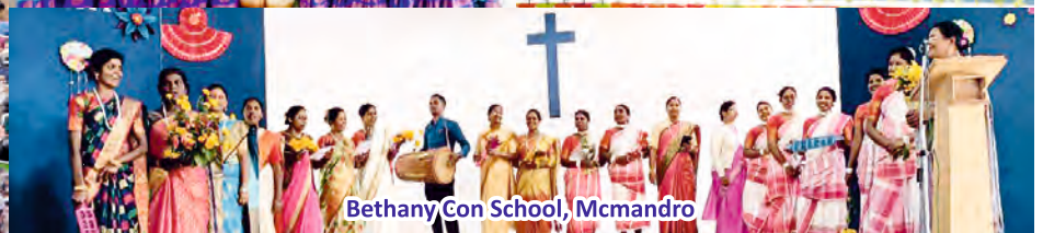
Bethany Con School, Mcmandro