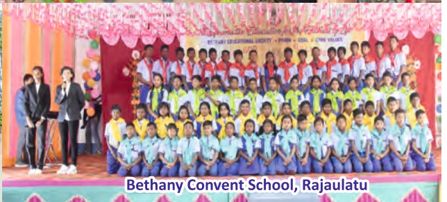
Bethany Convent School, Rajaulatu