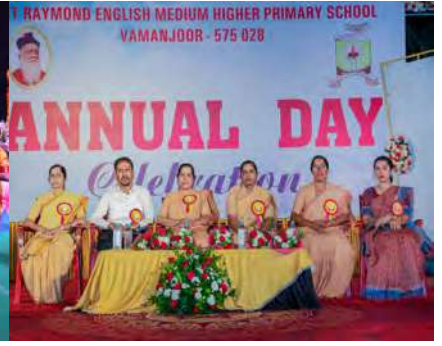
St Raymond English HPS, Vamanjoor