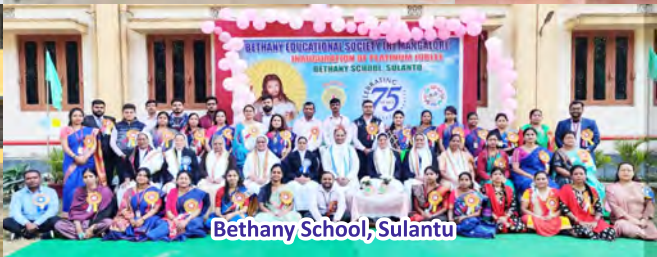
Bethany School, Sulantu