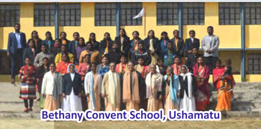
Bethany Convent School, Ushamatu