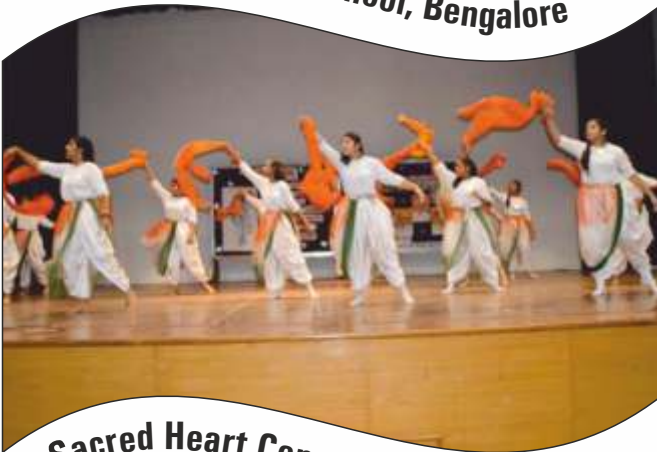
Sacred Heart Convent School, Ludhiana