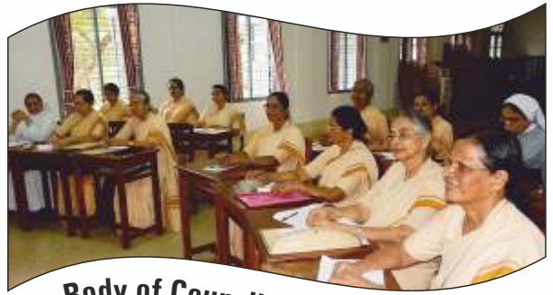
Body of Council of Management