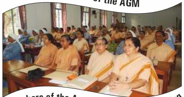
Members of the Annual General Body Meeting