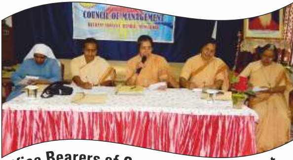
Office Bearers of Council of Management