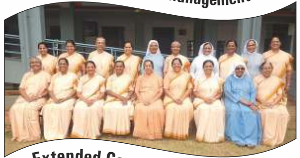
Extended Council of Management