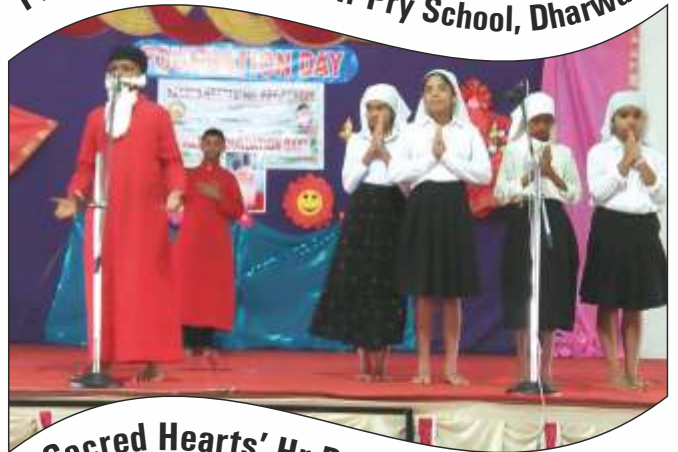
Sacred Hearts' Hr Pry School, Kulshekar