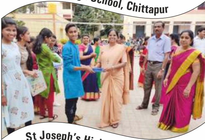
St Joseph's High School, KR Nagar