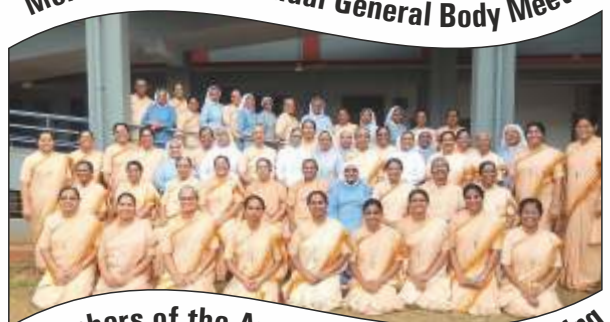
Members of the Annual General Body Meeting