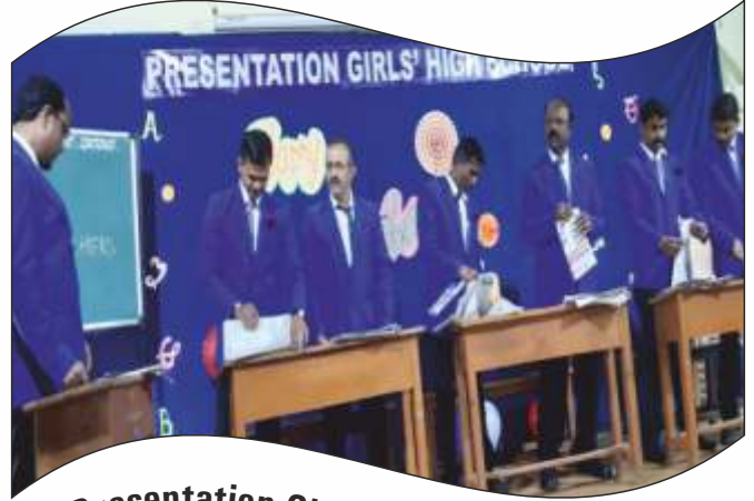
Presentation Girls' High School, Dharwad