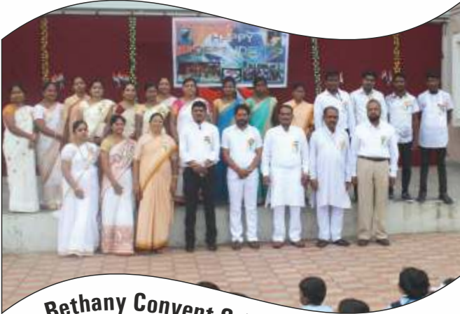
Bethany Convent School, Kalaburagi