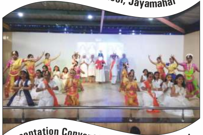
Presentation Convent Hr Pry School, Dharwad