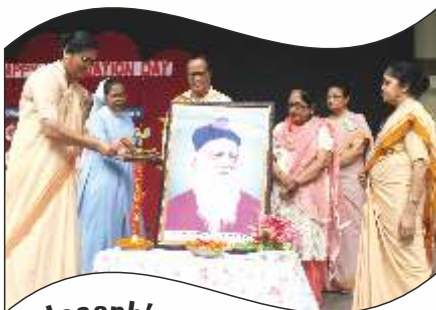
St Joseph's Convent, Bathinda