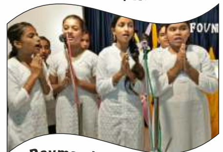
St Raymonds HPS, Vamanjoor