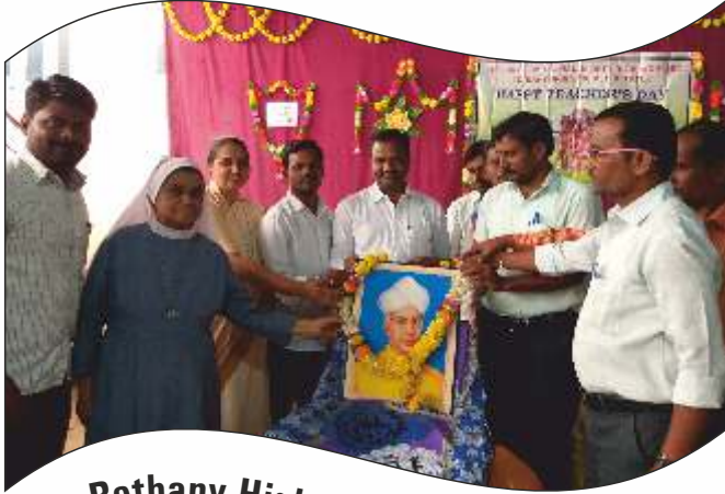
Bethany High School, Chittapur