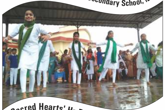
Sacred Hearts' Hr Pry School, Kulshekar