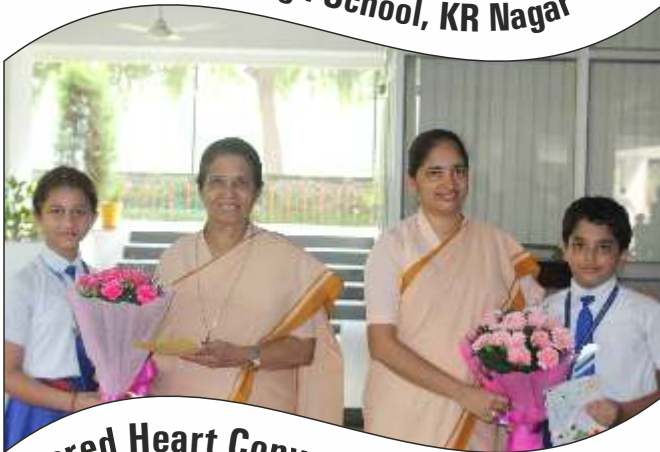
Sacred Heart Convent School, Ludhiana