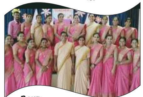
St Raymond's Eng, HPS, Vamanjoor