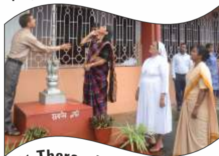
St Theresa's School, Bendur