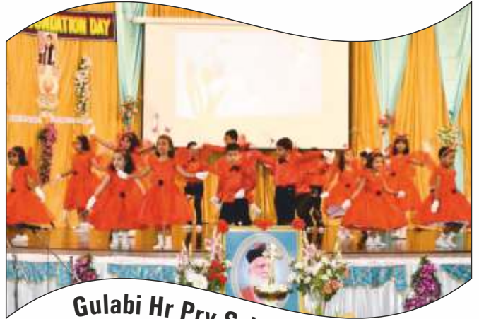
Gulabi Hr Pry School, Jayamahal