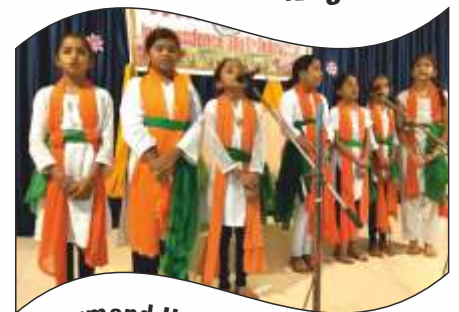
St Raymond Hr Pry School, Vamanjoor