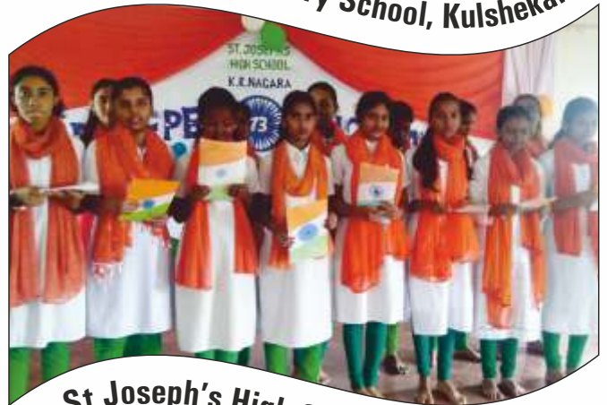
St Joseph's High School, K R Nagar