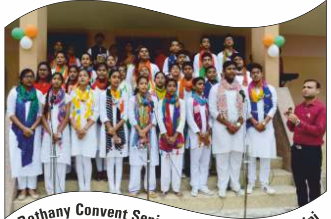
Bethany Convent Senior Secondary School, Naini