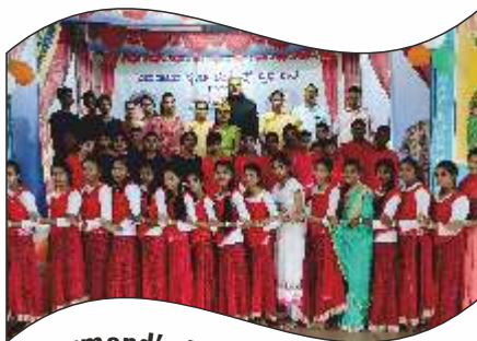
St Raymond's High School, Vamanjoor