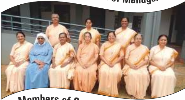
Members of Council of Management