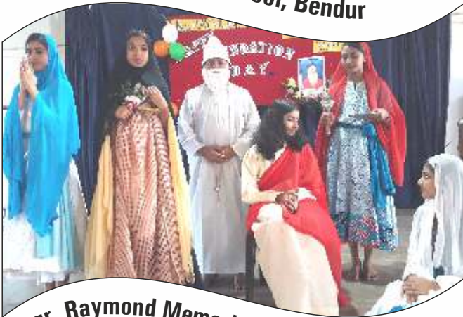
Msgr. Raymond Memorial School, Chempanoda