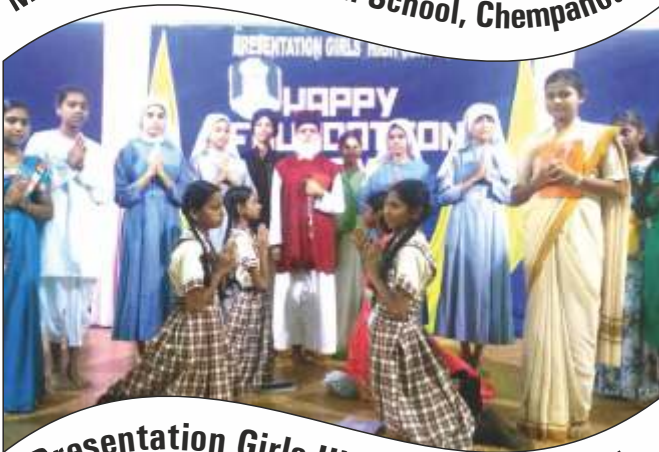
Presentation Girls High School, Dharwad