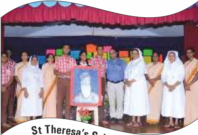
St Theresa's School, Bendur