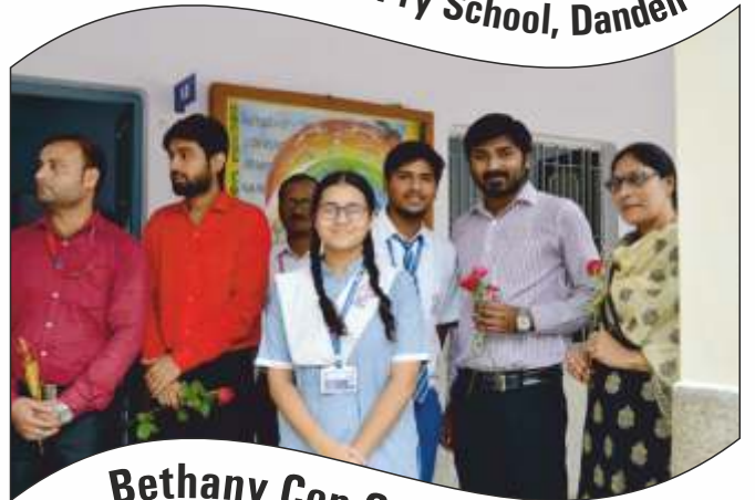
Bethany Con School, Naini