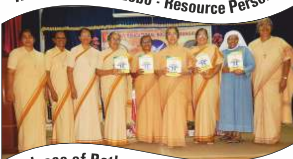
Release of Bethany Champions' Manual