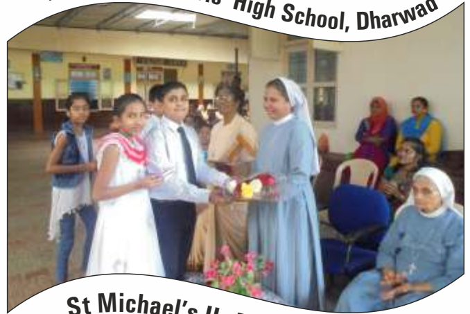
St Michael's Hr Pry School, Dandeli