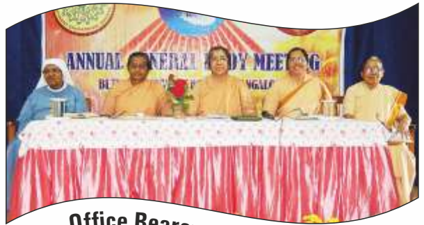
Office Bearers of the AGM