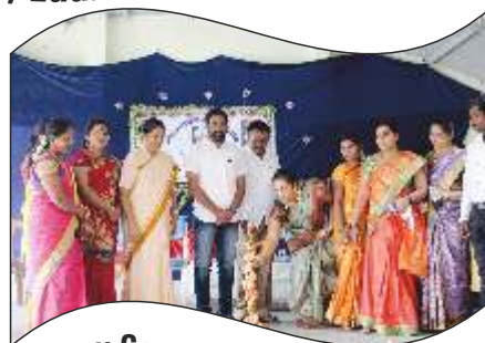
Bethany Convent School, Kalaburagi