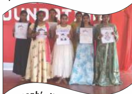
St Joseph's High School, K R Nagar