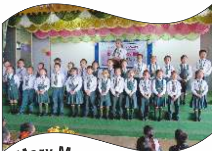
Mary Mount HPS, Aizwal