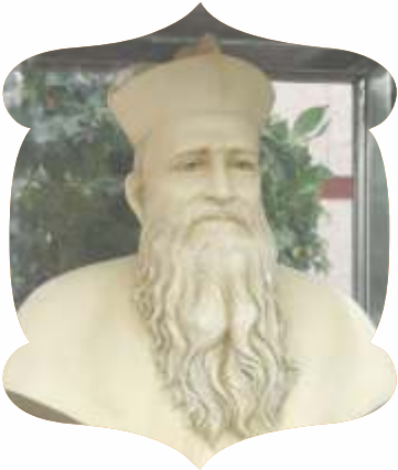
Sacred Heart Con School, Barnala