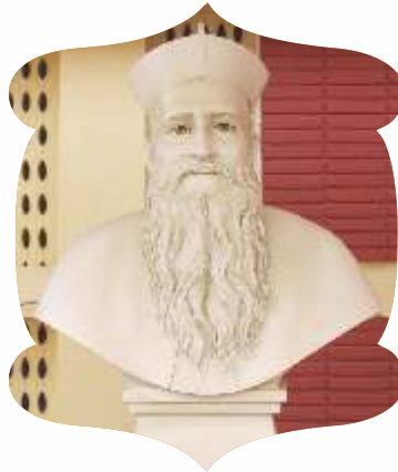
St Joseph Con Sr Sec School, Bathinda