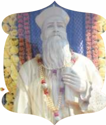
St Rita's HPS, Dornahalli