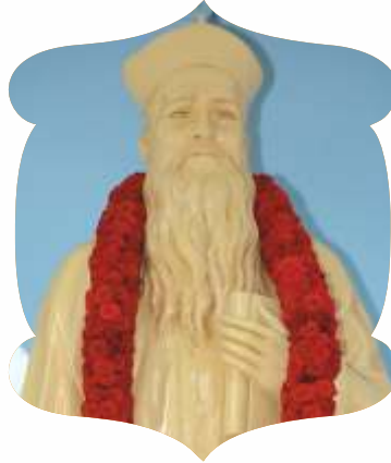
St. Michael's Convent Hr. Pry. School, Dandeli