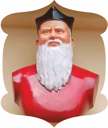
St. Maria Goretti School, Kolasib, Mizoram