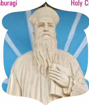
Loyola High School, Gadag