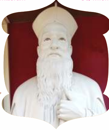
St. Michael's Girls HSS, Westhill