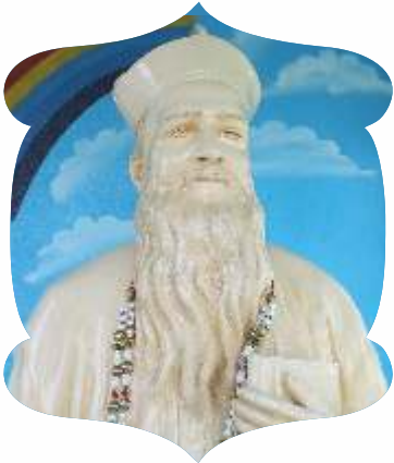
Bethany Eng Pry School, Kalaburagi