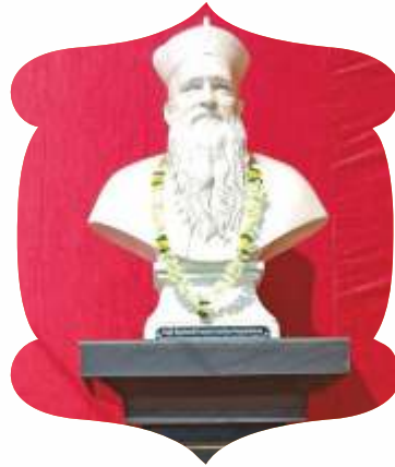
Bethany Convent School, Salcette, Goa