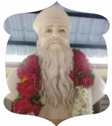
Shishuvihar Hr Pry School, Chittapur