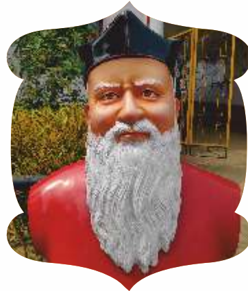
Holy Cross Convent School, Dharmanagar