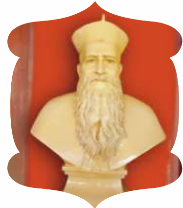
St. Joseph's Eng Pry School, Sagar