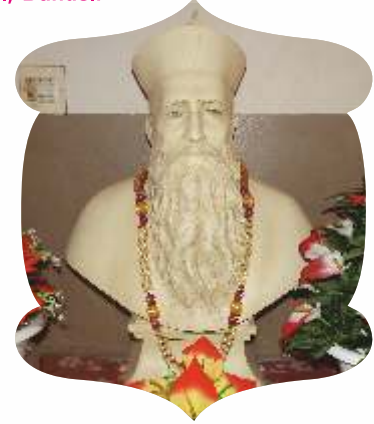
St. Sebastian's High School, Loliem Goa