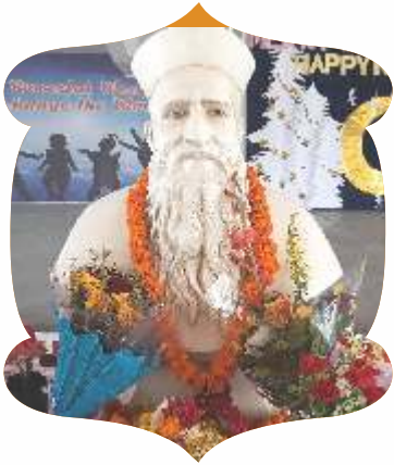
Bethany Con School, Bargarh